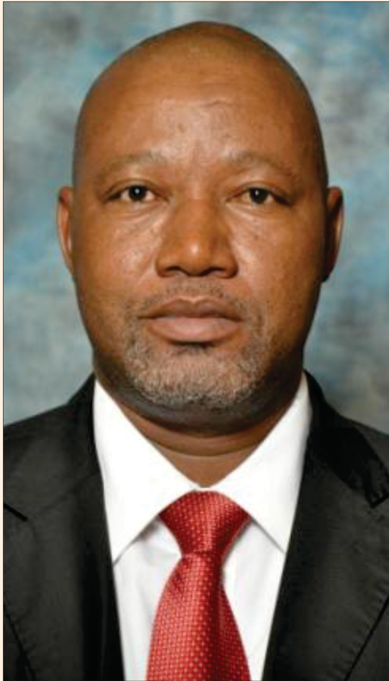
HONOURABLE BOIKANYO RAYMOND ELISHA MEMBER OF THE EXECUTIVE COUNCIL FOR PUBLIC WORKS, ROADS AND TRANSPORT NORTH WEST PROVINCE